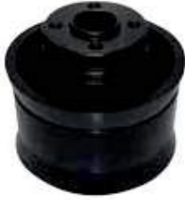
RUBBER PISTON 230MM