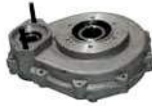
AGITATOR GEAR BOX