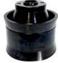
RUBBER PISTON 200MM